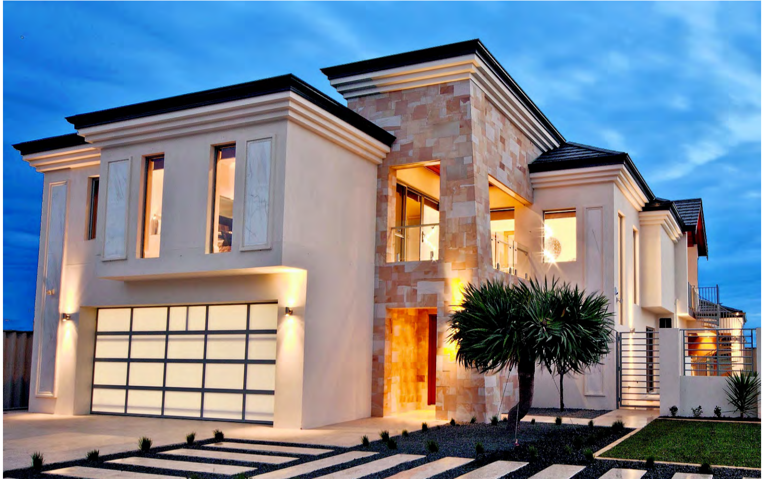
The Miravet has a solid and imposing presence with double-height Donnybrook stone to the portico hinting at the stone walls of its namesake.

Upstairs, at the front of the home is the main bedroom suite, which has a big walk-in robe with built-in cabinets and a laundry chute. The ensuite has a